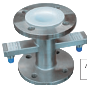
Microwaves measuring cell nominal width 50 mm