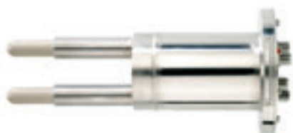
Container flush probe